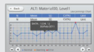
Quality control result display